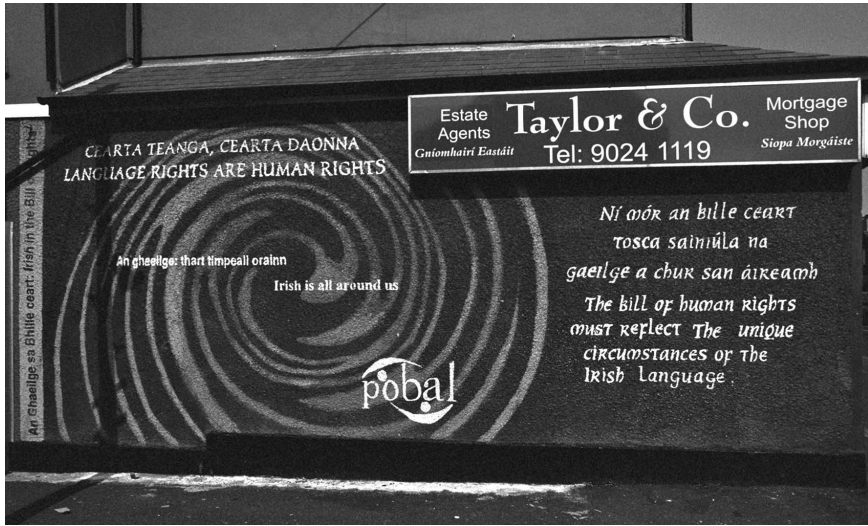
Figure 1.1 Mural – ‘Irish is all around us’

of the newly established Northern Ireland Human Rights Commission to prepare a Bill of Rights for Northern Ireland, which would define rights in addition to those enumerated in the European Convention on Human Rights, reflecting the particular circumstances of Northern Ireland (Northern Ireland Office 1998: Section 6-II/III-§3-4). Against this backdrop, the mural underlined demands for specific language rights for which Pobal had continuously lobbied.