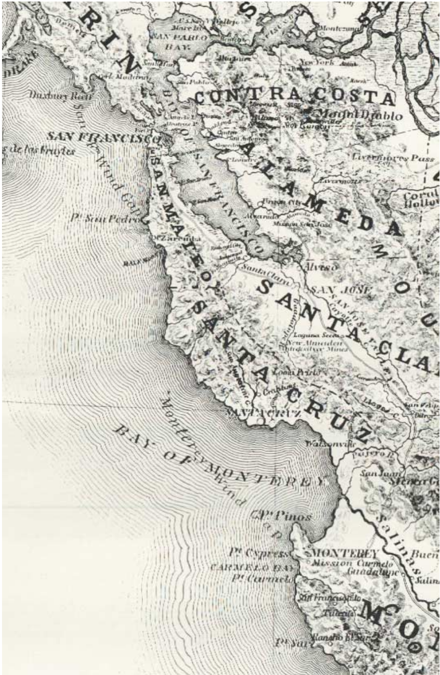
Figure 0.1. Map of the central coast of California in 1856. The Loma Prieta Mountains are visible just to the right of the large letter “A” in “Santa Cruz.”