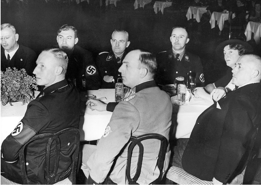
Illustration 0.1 Some of the men who attended the Wannsee Conference had previously met at various functions and festivities. At the pictured gathering, organized by the Reich Ministry of the Interior in 1937, Heydrich and Stuckart are seated opposite one another. Seated next to Heydrich is Kurt Daluege the head of the Ordnungspolizei (regular police), and two seats along from Stuckart—with a full beer glass—is Heinrich Himmler.