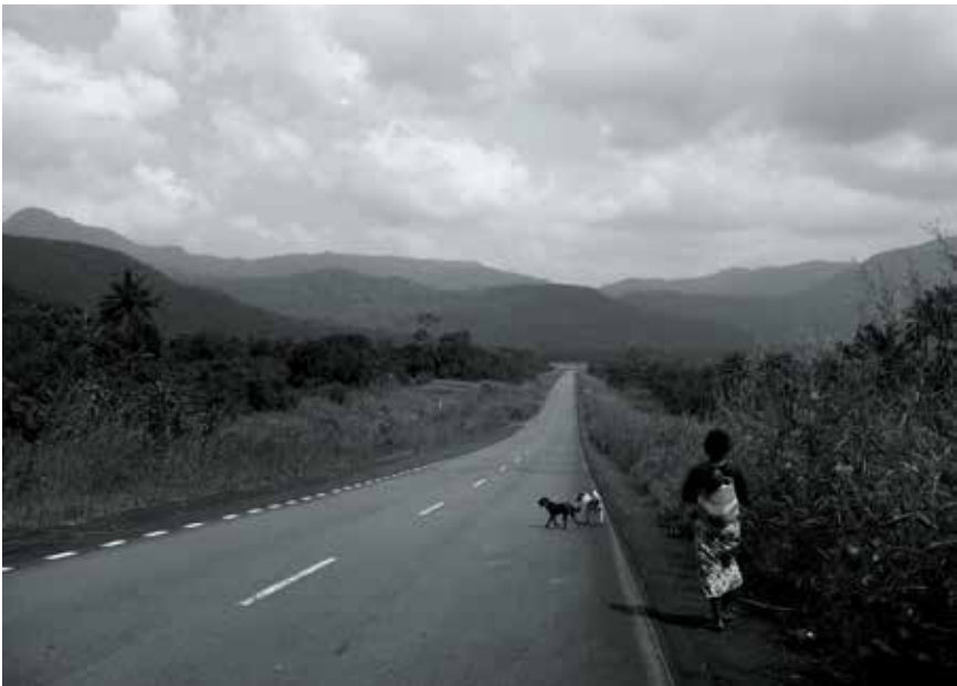
Figure 1.2. The Peninsula Road near York, 2012.

Between Tokeh and Mama Beach, the forest landscape was still preserved and the large hills loomed impressively over the visitor. This part of the Peninsula is further from Freetown's centre and was perceived by many living in Freetown as less accessible, as it was necessary to drive around via the east road (via Waterloo and Tombo) to reach those settlements. Thus, urban encroachment was not yet visible, but in many places, pillars, fences and signboards signalled private