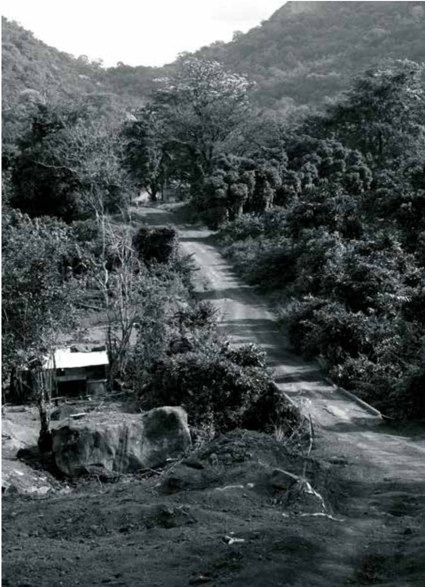
Figure 1.1. The Peninsula Road near Sussex, 2012.