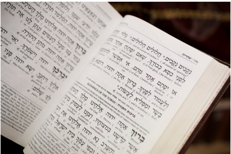
FIGURE 0.1 Torah Judaism, Jewish Manchester.

‘fundamentalist enclaves’; terms often used in the context of Israel (such as Aran, Stadler and Ben-Ari 2008; Stadler 2009; and Hakak 2012). 43 The ‘fundamentalist’ label is imposed on minority groups but should be used with caution, as socio-religious movements ought to be considered in their own contexts, and recycling the term presents the risk of conflating the practices of disparate groups. 44 The term ‘fundamentalism’ (and also ‘extremism’) forms part of the socially constructed pursuits of religious authenticity that, in public discourse, are typically discussed at length in the context of Islamic groups. Applying blanket terms like ‘fundamentalism’ to the Haredim is not conducive to understanding the complexities at play for socio-religious minority movements – who might exist in a fluid and relational tie with the external world (cf. Stadler 2009). It casts religious groups such as the Haredim against an imagined and polarised construction of a liberal British ‘norm’, 45 which is not reflected in the current climate of social conservatism and fervent nationalism made visible by the 2016 ‘Brexit’ Referendum. 46 Whilst Haredi Jews in England are positioned as part of a global and growing ‘ultra-Orthodox’ movement, this book explores the importance of (and relation between) cosmology and local context when attempting to understand conducts of health and bodily care that are not in the desired manner of ‘compliance’.