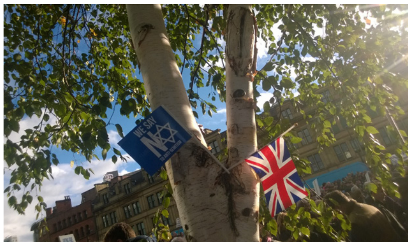
FIGURE 0.3 ‘We say no to antisemitism’ demonstration staged in Manchester, October 2014. Photograph by the author.

Responses in Jewish Manchester to the 2014 Israel–Gaza conflict and the string of attacks committed against Jews in Europe varied between prayers of redemption or of mourning, or city centre demonstrations organised by local Israel advocacy groups (Figure 0.3). 53 These responses indicated how Jewish Manchester did not sit in isolation from, but in relation to, events in the broader Jewish and non-Jewish worlds. Jewish Manchester itself was not immune from hate crimes. Two local Jewish cemeteries were targeted over the course of my research, with vandals desecrating, damaging and tagging swastikas on headstones, which heightened perceptions of vulnerability (see BBC News 2014; Halliday 2016). In 2017 two popular kosher restaurants in Manchester were set ablaze, one of which was being investigated by local police forces for ‘antisemitic hate crimes’ (Sugarman 2017), and no doubt fuelled many apprehensions that Jewish Manchester would face an act of targeted terror. 54 The preference for self-protection (which has implications for the relation between the state and the Haredi minority) must be cast against this backdrop of perceived vulnerability and the local