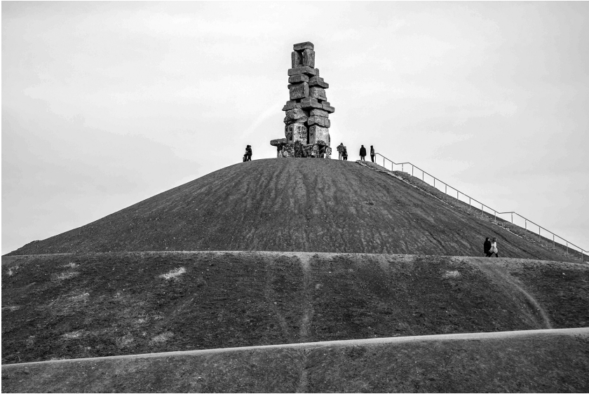
Figure 4.2. View of the Halde Rheinelbe, a pithead stock in the Ruhr. Photowalk.

During a photowalk at the Light Festival in Essen, another Instagram user who works as a regional influencer with cities in the Ruhr mentioned how important it is to always include a visual reference to the past in his photos. He considers this the uniqueness of the Ruhr – that something new can arise from a broken past. He stated that he wants to capture this positive excitement and curiosity towards the future in his pictures. In addition to his photographs, he also referred to a fashion label from the Ruhr that upcycles materials of industrial labour and uses heavy industry-related symbols for its fashion designs – for example, they almost always contain the colour black or the silhouette of a mining tower to symbolize the regional significance of the coal. Thus, visualizations of industrial legacy, which serve as representations of the past, are newly mixed with elements representing change and transformation, as the interview statements show. This thoughtfulness regarding the past and its significance for the future development of the region was evident in other interviews and in my observations.