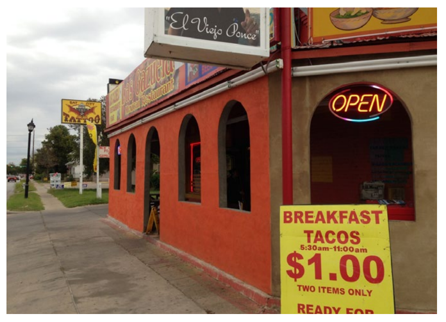
Figure 12.3 Las Cazuela Mexican Restaurant, Austin, Texas, 2014.

the cuisine to survive in the USA. If it were too authentic (for example, pig's trotters), it would be rejected. If it were too American, it would no longer be attractive, as it would not provide the 'self-validating "ethnic experience", a mark of ... tolerance and sophistication ... as dining out is identity work' (Fine and Lu 1995: 547). The authors see the negotiation of authenticity on an individual level as contributing to the shaping of ethnic culture on a societal scale. 'Through our purchases and presence, we validate the legitimacy of the group and of the American polity, all the while altering the ethnic culture to make it congruent with mainstream values and tastes' (Fine and Lu 1995: 549). Many successful designs associated with Mexican food also operate within these constraints, neither shocking nor challenging widely held beliefs, but appealing to a circumscribed Anglo adventurousness.