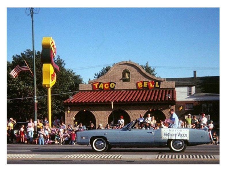
Figure 12.1 Taco Bell, Evergreen Park, Illinois, Fourth of July Parade, 1977.

were positioned to take advantage of an 'ethnic boom'. Food trade journals wrote of an increased appeal for foods ranging from pita bread sandwiches to tortellini, as well as burritos, fajitas and taco salads. Belasco asks whether this was a step towards achieving the democratic ideal of pluralism and equality or 'depressing evidence of corporate conglomeration and cultural homogenization' (Belasco 1987: 1). Ethnic fast food multinationals were in fact simply cashing in on a wider cultural phenomenon, a 'grassroots ethnic revival', while, according to Belasco, engaging in a hegemonic process where 'dominant forces . . . incorporate insurgent strivings' (Belasco 1987: 3). Because the members of the grassroots ethnic revival in the USA were mostly affluent and educated, this provided a great opportunity for food marketers. Rejecting past strategies that targeted an undifferentiated consumer mass, the food industry divided the 'ethnic revivalists' of the 1970s and 1980s into segments from first-generation consumers who desired simple, fundamental ingredients for use in traditional recipes to those who wanted an 'Old World aura' through the use of 'processed convenience foods', some spices and a 'picturesque package' (Belasco 1987: 8). Laying the foundations for the ethnic revivalists were fast food restaurants like Taco Bell.