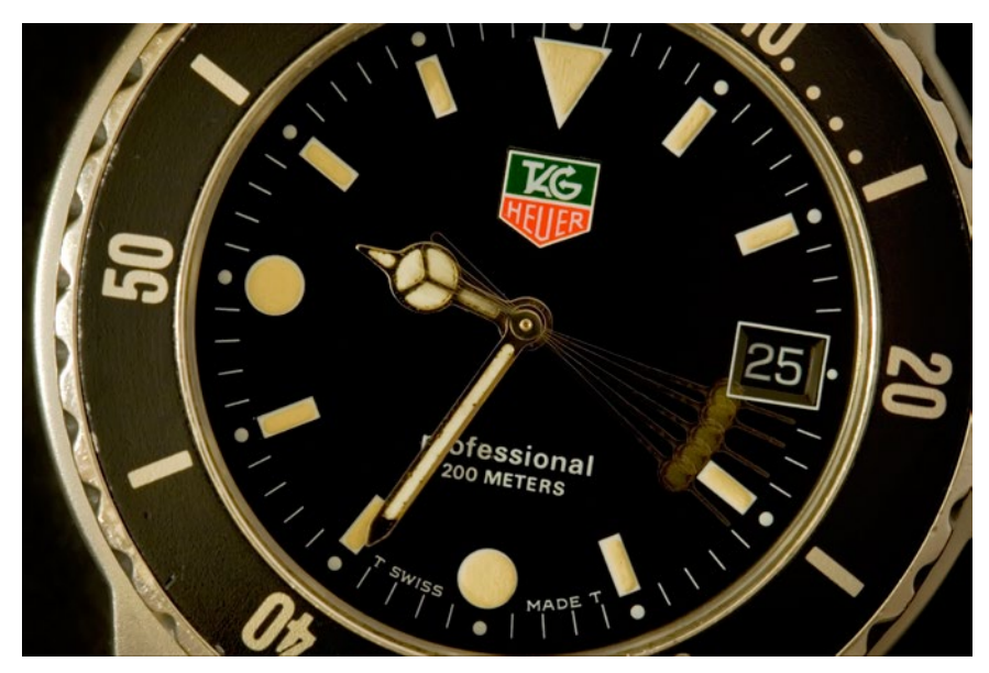
Figure 9.2 Photo depicting 'Swiss Made' print on TAG Heuer watch.

For example, in Switzerland, the predicate 'Swiss Made' on watches is governed by strict national rules ('232.119 Verordnung vom 23. Dezember 1971 über die Benützung des Schweizer Namens für Uhren', retrieved 30 March 2014 from http://www.admin.ch/opc/de/classified-compilation/19710361/index.html). The phrase 'Swiss Made' seems to be the first such national designation, arising, in English, in response to the Centennial Exposition in Philadelphia of 1876, at which there seemed no way to distinguish American products from others (Wälti 2007). Thus, reflexively, again, it was reception in a foreign country, or the need for clarification in exports, that motivated a legal enactment of national branding. That it was in response to the Centennial Exposition helps to explain why a nation with four official languages should use a fifth language, English, to brand its products. There is a further aspect of specific interest to design historians: the phrase was not to be hidden on the back where such labels usually belong but was incorporated into the face as an element of the design. The phrase selected was 'Swiss Made' rather than 'Made in Switzerland' because the nine letters plus one space could be disposed symmetrically around the numeral 6, and thus they remain as a constant element in Swiss design.