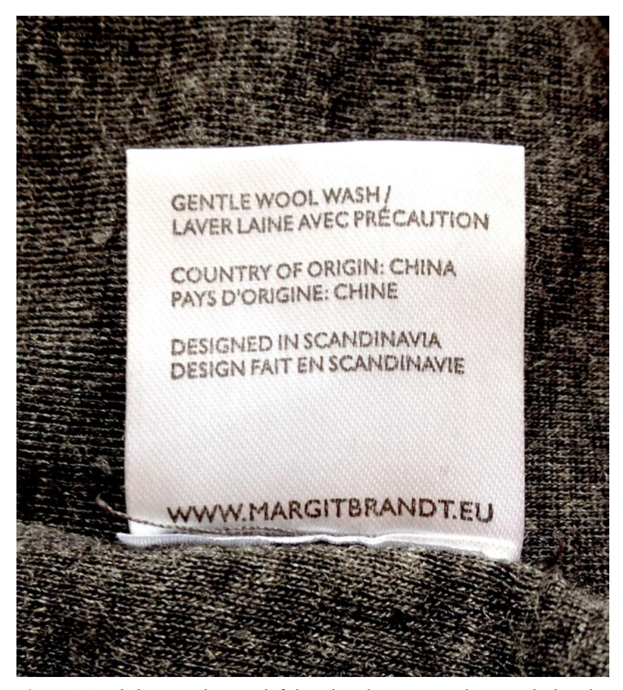
Figure 9.5 Label in tunic by Danish fashion brand Margit Brandt, 2013. The brand existed in the 1960s and 1970s and was relaunched in 2005.

no nation at all, the European Union. In this matter of origins the European Commission appears to have underestimated the strength of the link between design and nation and the value of design for the national identity of European countries. Likewise, design historians may have been seduced by the rhetoric of globalization and have thus overlooked the continuing importance of the nation-state with its laws, its export policies and its promotional practices.