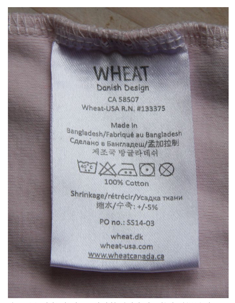
Figure 9.1 Label in shirt by Danish children's clothes brand 'Wheat' (2014).

the 'Designed in ...' labels constitute a new and ingenious way of linking designs with nations.