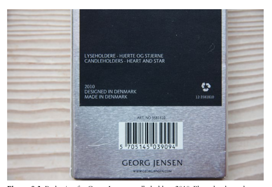
Figure 9.3 Packaging for Georg Jensen candle holders, 2010.

In the post-industrialist economy most design companies have seen it as economically sound, or even a condition for survival in a global market, to move production to so-called 'low-cost countries'. And the development is not restricted to Denmark and Danish design. In Britain, for example, the Burberry brand – despite its heavy brand reliance on 'Britishness' and its appointments by royal warrant to the Queen and the Prince of Wales – has been closing down factories in Wales and Yorkshire and has moved much of its textile manufacturing to China (Gould 2009). The reliance of Italian manufacturers on Chinese (legal and illegal) immigrant workers in the production of designs that are 'Made in Italy' has become widespread. An example is the production of traditional fine fabrics in Tuscany: commentators have remarked on the 'non-Italian' nationality of labourers making these goods (Donadio 2010).