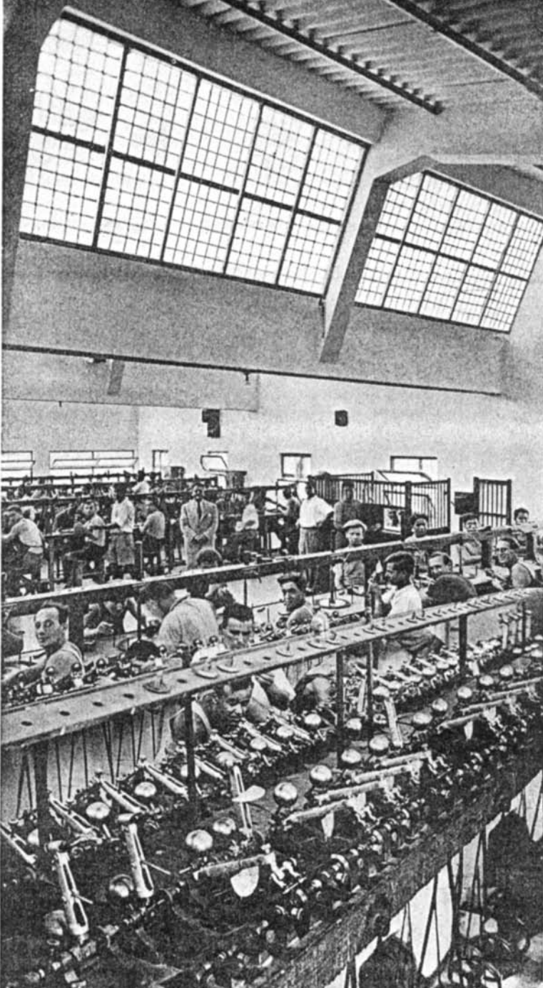
Illustration 1.1. Alamz diamond factory in Netanya, 1944.