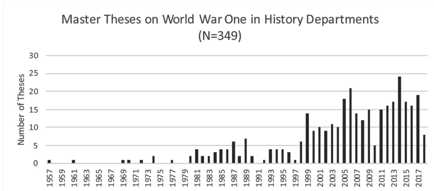
Figure 2.1. Master's Theses on World War I in History Departments (n=349).

The predominance of the Catholic University of Louvain where academic production is concerned can also be observed with regard to final dissertations. More generally, in spite of a more limited number of students, French-speaking universities are “producing” two-thirds of these works, seemingly revealing a greater interest in World War I in the south of the country than in the north. This imbalance is even more flagrant where doctoral theses are concerned: over the past three decades, ten theses about the Great War have been submitted in French-speaking universities, as opposed to five in Flanders. How are we to explain this lopsidedness? In the first analysis, we might put forward the hypothesis that the “patriotic” character of the Belgian experience in 1914–18 would pose more of a problem in Flanders, whereas it would be desirable in a French-speaking Belgium, which is apparently ever more attached to unitarianism. But, in a more prosaic way, the explanation probably has to do above all with systems of historiographical logic. The early re-